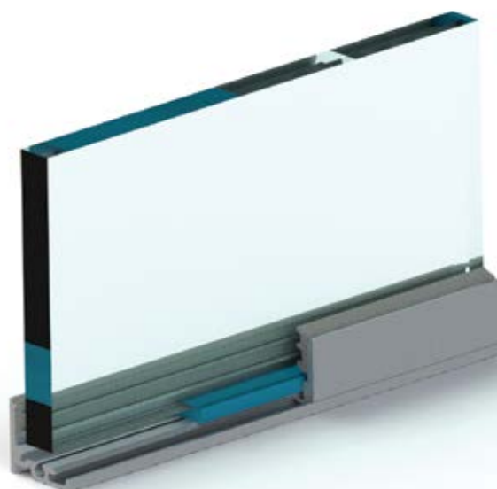
GSW Light UI