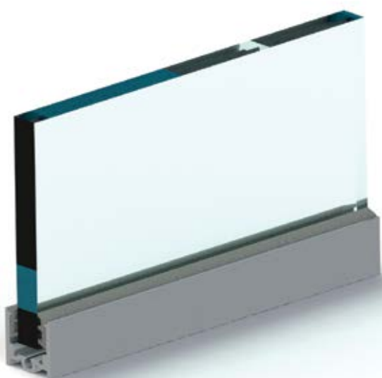
GSW Light U