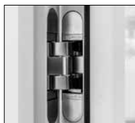
H7-HT, with H7BTF reinforced frame: Invisible hinges

Images may not reflect your exact model and are for reference purposes only.