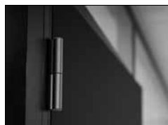
Stainless steel hinges